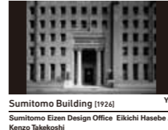
Sumitomo Building [1926] YS Sumitomo Eizen Design Office Eikichi Hasebe / Kenzo Takekoshi