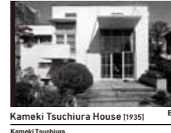
Kameki Tsuchiura House [1935] EK Kameki Tsuchiura