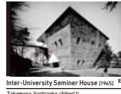
Inter-University Seminar House [1965] EK Takama Yoshizaka (AtlierU)