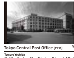
Tokyo Central Post Office [1931] YS Tetsuro Yoshida (Building Section of Post Telephone Telegraph Office)