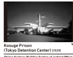
Kosuge Prison (Tokyo Detention Center) [1929] YS Shigeo Kanbara (Building Section of Judicial Office)