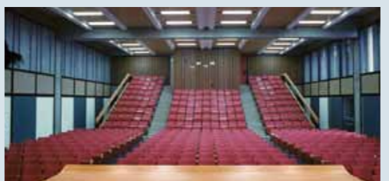
Owned : Kagawa Prefectural

The Kenzo Tange Laboratory was responsible for the design of the garden. Oil-based clay was used in many layers of the study, and the garden stones were laid in the pond as a "symbol of good harvest" and part of the wish for the rich lives of the local people, which was contrary to the typical ideas that go into Japanese gardens, like the wish for the long youth and longevity of the owner.