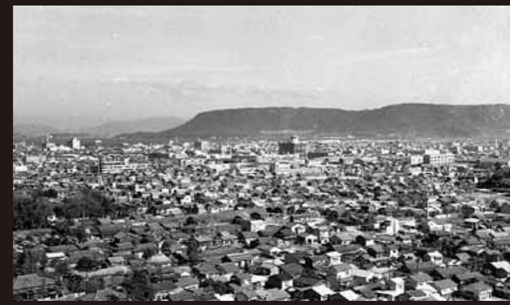
Kagawa Prefectural Government Office at the time of completion (center) and Takamatsu City (1958)

The East Building of the Kagawa Prefectural Government Office was completed in 1958 (the original main building and east building, design by Kenzo Tange) and is seen as a representative piece of post-war Japanese architecture. Even now it receives a steady stream of visitors. With design plans, sketches, and photographs from the time of completion, this exhibition will look at the ideas behind its conception and design, how it was completed, and the contribution it has made to Japanese architectural history.