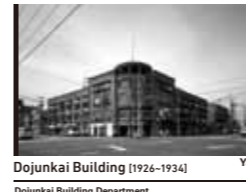
Dojunkai Building [1926-1934] YS Dojunkai Building Department