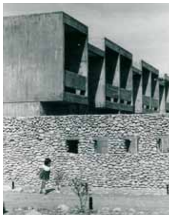
Ichinomiya Row Houses, Takamatsu (1960-64) Not extant