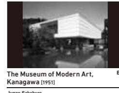
The Museum of Modern Art, Kanagawa [1951] EK Junzo Sakakura