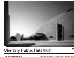
Ube City Public Hall [1937] YS Togo Murano Important Cultural Properties