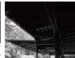
Miyuki-no-ma, Hashshokan [1950] YS Sutemi Horiguchi