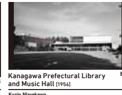
Kanagawa Prefectural Library and Music Hall [1954] Kunio Mayakawa