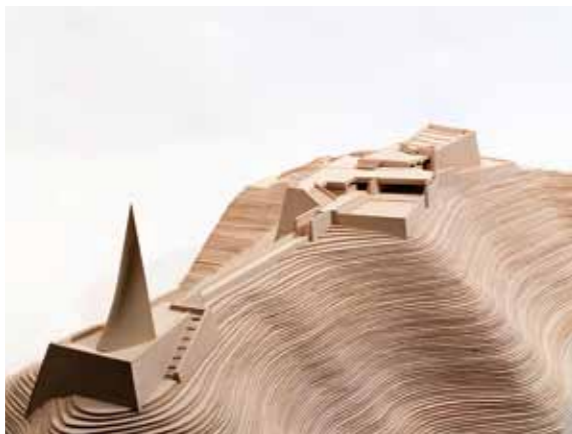
Model of Memorial for Students Who Perished in the War (1966)