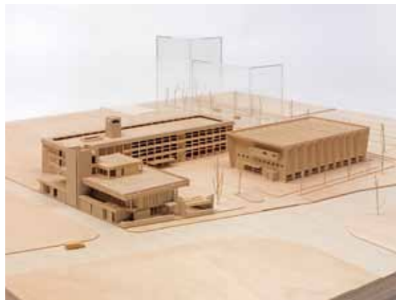
Model of Imabari City Office Complex (City Office, City Assembly 1958, Public Hall 1965)