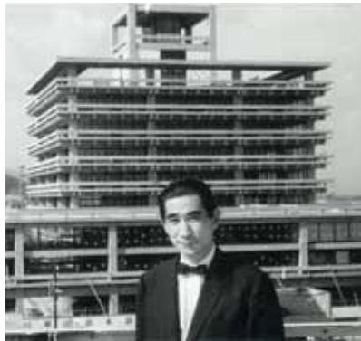
Commemorative photograph of Kenzo Tange taken just before completion (Spring 1958)

Many of the early works of Kenzo Tange are found in the Setouchi area, and are in tune with Japanese traditions, local characteristics, and the prevailing post-war democracy. For Kenzo Tange, the Setouchi was where he discovered his unique identity, gained a large number of supporters and collaborators, and where he first developed architecture that was connected to real society. The Kagawa Prefectural Government Office is the result of his time here. The works of Kenzo Tange that remain in the various areas of the Setouchi serve to inspire architects working here, and have given rise to a number of new distinctive works. His buildings have become the influential foundation of the architectural culture of the Setouchi area.