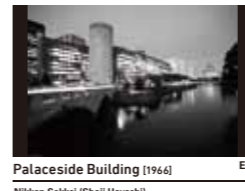
Palaceside Building [1966] EK Nikken Sekkei (Shoji Hayashi)