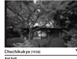
Chochikukyo [1928] YS Koji Fujii