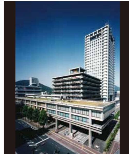
Kagawa Prefectural Government Office [1958] TM Kenzo Tange