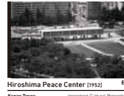
Hiroshima Peace Center [1952] EK Kenzo Tange Important Cultural Properties