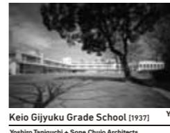
Keio Gijyuku Grade School [1937] YS Yoshiro Taniguchi + Sone Chujo Architects