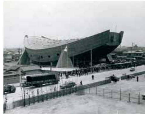
Kagawa Prefectural Gymnasium (1964) / Owned : Kagawa Prefecture