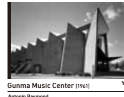
Gunma Music Center [1961] YS Anton Raymond